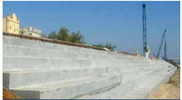
North Beach Blvd. Seawall - Bay St. Louis, MS