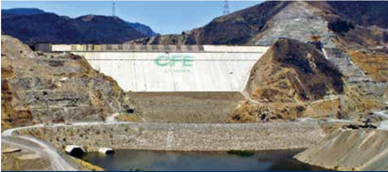
La Yesca Hydroelectric Dam, Hostotipaquillo - Jalisco, Mexico