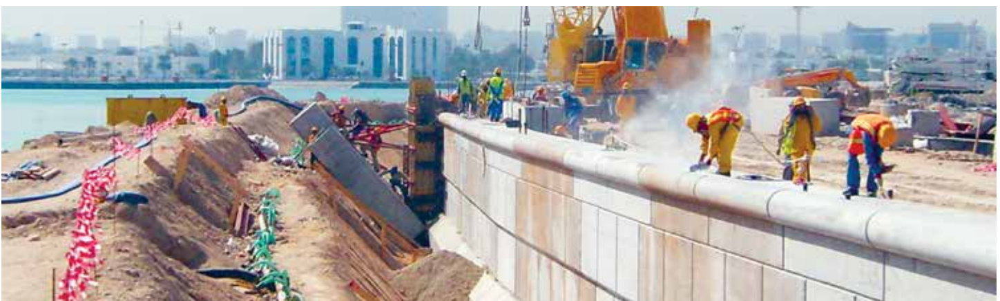
Al Sowwah Island Diaphragm Wall - Abu Dhabi, UAE