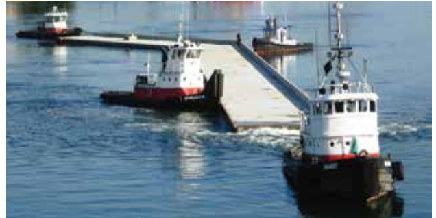
Floating Marina Breakwater - Port Orchard, WA