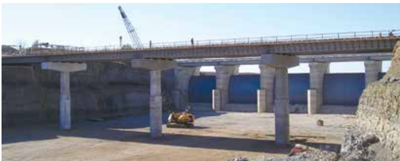
State Hwy 100 over Illinois River Lake Tenkiller Spillway - Vian, OK