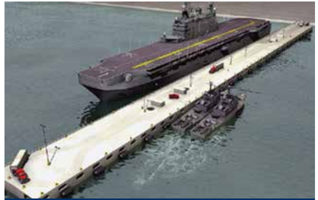
US Navy - Naval Facilities Engineering Command Modular Hybrid Pier (MHP)